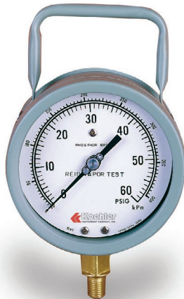
311-060-002 RVP Gauge