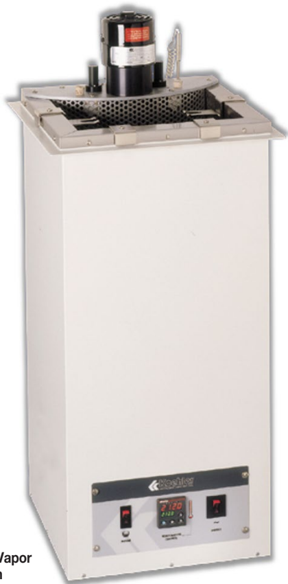
K11450 Reid Vapor Pressure Bath

Test apparatus for liquid products (ASTM D323) requires: