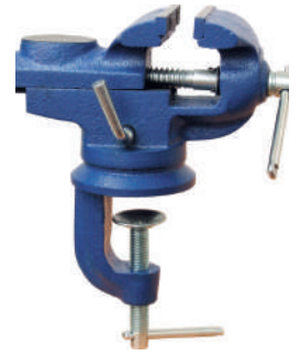
Bench Vise for holding pressure vessel. Customization as per client requirement is possible.