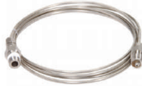
(316 stainless braided hose)