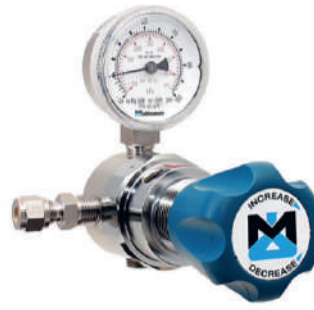
(High-purity stainless steel line regulator)