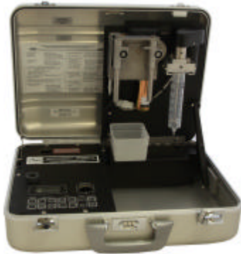
Model 1140 Micro-Separometer™ Water Separation Instrument

The Model 1140 Micro-Separometer™ instrument is a electro-mechanical instrument used to perform four discrete tests.